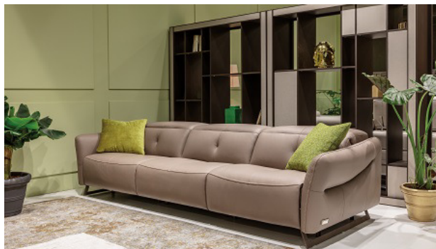
Calypso is one of eight frames from Estro Milano set for High Point Market .

"The company is relatively new to the U.S. market but is focused on expanding its presence on this market," said De Cataldo in an e-mail. "Our strength is a wide selection of stylish, design-oriented power motion styles — power motion upholstery that even the most design oriented purchaser appreciates and does not need to hide in a man-cave.