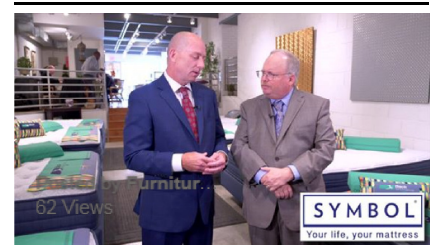
Surf's up at Paramount Sleep