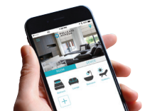
Automate™ Advanced Motorization Technology Compatibility

Create Custom Roman Shades Designed For Your Lifestyle with the Trevi® Collection of Roman Shades from Tiger Window Fashions.