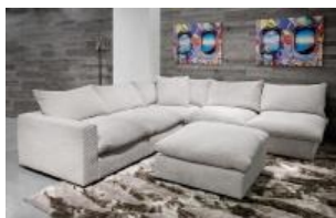
Lazy H: 33" x W: 126" x D: 119"