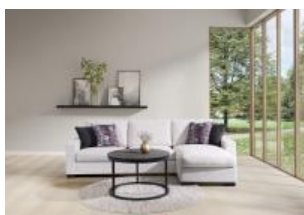
Lance H: 31" x W: 108" x D: 64"