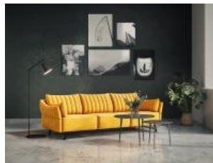
Cassie H: 32" x W: 91" x D: 41"