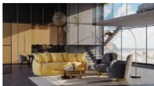
Aramis H: 33" x W: 105" x D: 42"