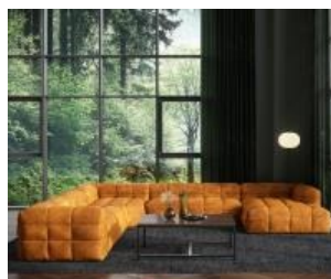
Michelin H: 27" x W: 149" x D: 127"