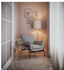
Leah H: 17" x W: 27" x D: 31"