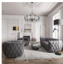
Goldy H: 27" x W: 95" x D: 36"