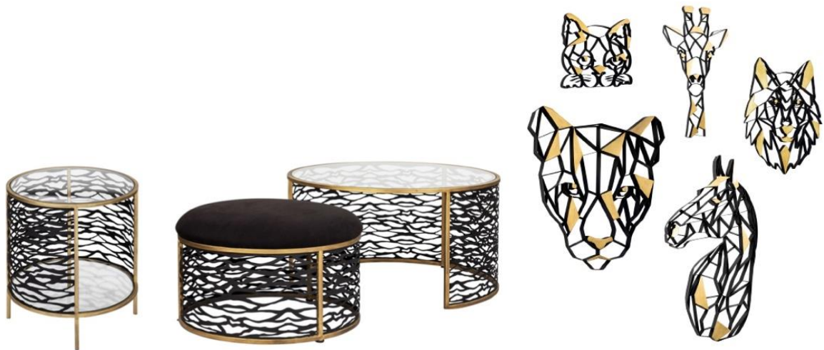
Kato end table and nesting coffee table and ottoman, Geometric Animal Kingdom

Smithsonian Illuminated and Smithsonian Décor collections are available through Varaluz's authorized network of decorative lighting showroom dealers.