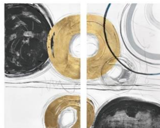
Circle Gets a Square