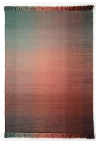
Shade Palette 1