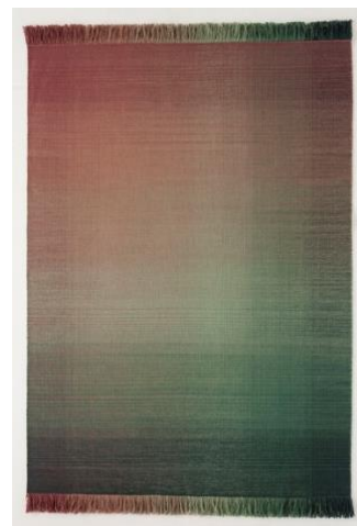
Shade Palette 3