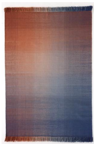
Shade Palette 2