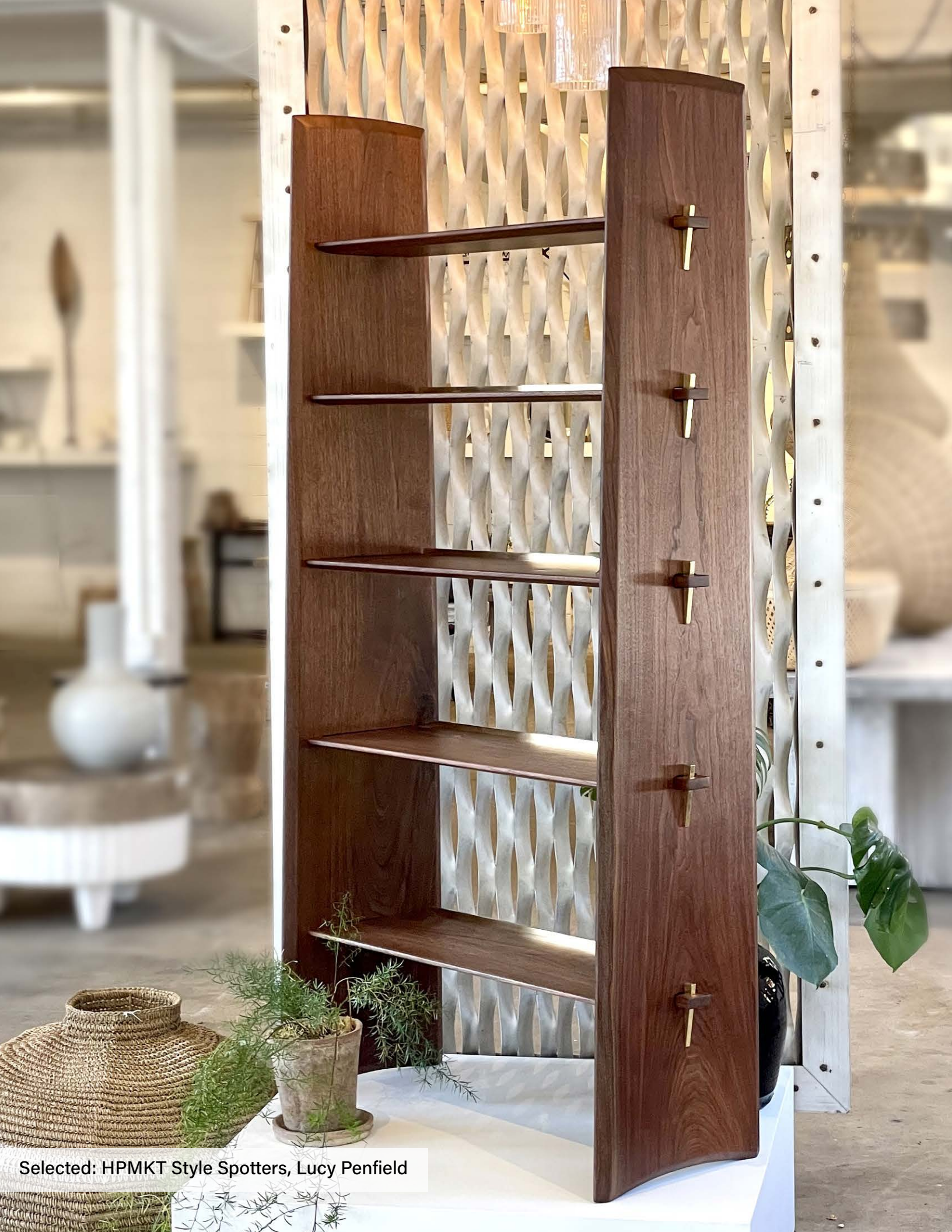
Selected: HPMKT Style Spotters, Lucy Penfield