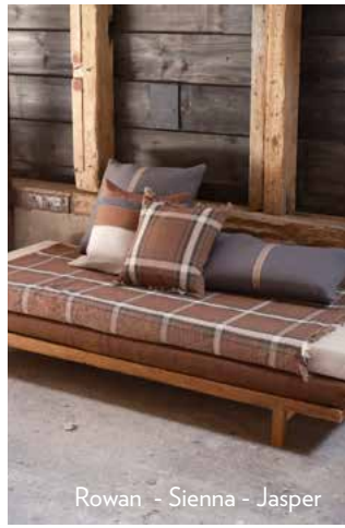
Rowan - Sienna - Jasper