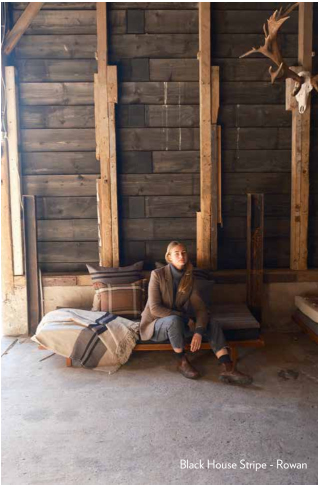
Black House Stripe - Rowan