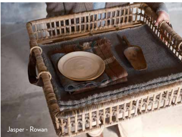
Jasper - Rowan