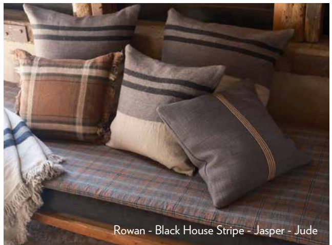
Rowan - Black House Stripe - Jasper - Jude