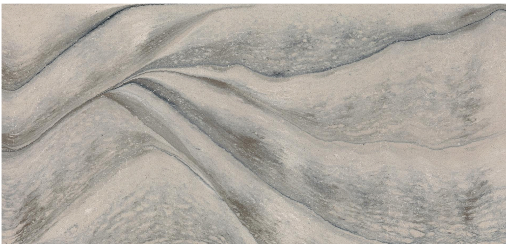
Cambria design shown: St. Isley

St. Isley™: For those ready to make a statement, St. Isley is unapologetically bold. Dynamic waves of blue-gray veining intertwine with warm taupes and dark grounding accents, creating a design that feels confident, artistic, and alive. Whether used as a dramatic island, a focal-point fireplace wall, or a luxe commercial interior, it offers motion, contrast, and undeniable presence. Finish options: Polished and Cambria Satin