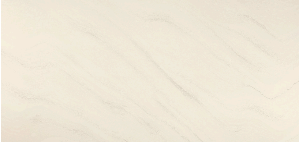
Cambria design shown: Kenwood

Kenwood™: Understated yet unforgettable, Kenwood is a masterclass in restraint. A creamy canvas is delicately layered with diagonal taupe veining and white crackles, offering a sense of movement without overwhelming. Inspired by organic form and timeless architecture, it pairs effortlessly with natural woods, brushed brass, or woven textures—ideal for spa baths, serene kitchens, or boutique retail. Finish options: Polished and Cambria Satin™