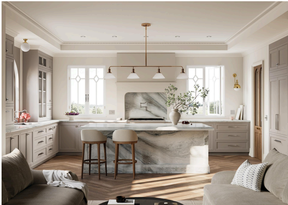
Cambria design shown: St. Isley

This new launch signals a continued evolution in Cambria's design philosophy—one where emotional connection, natural inspiration, and quiet innovation converge. It arrives at a moment when homeowners are craving warmth, organic depth, and texture in their spaces. From restorative neutrals to expressive veining, each surface is designed to reflect not only how people want their homes to look, but how they want to feel in them. An escape within.