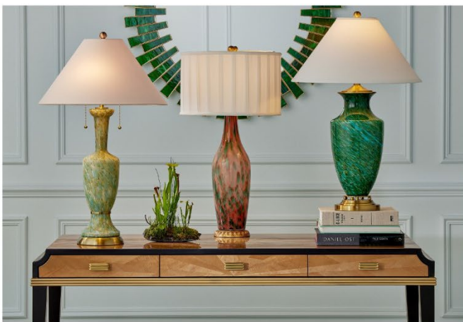
Classico Green, Brielle, Claude Green Table Lamps

The Transformation Box is a 12-inch round decorative box made of composite in a marbled green finish that resembles malachite. A brushed brass disc accents the center of the lid, adding a polished detail. The interior is finished in glossy black, providing a sleek contrast to the richly patterned exterior. Because it is made of artisanal material, its surface may vary slightly from box to box.