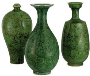
Romulus Green Vase Set

The word "green" holds many meanings. It is associated with emotions, greed, nature, sustainability, and is a much-loved color. Historical references for the use of green are endless. In Latin the word green is viridis , which is related to a large group of terms that suggest growth and even life itself. Green is a sympathetic, versatile color and supports others well but is also beautiful used alone. It includes a tremendous range of hues and variations including chartreuse, emerald, avocado, olive, celadon, apple, absinthe, forest, mint, kelly, sage, and the list goes on. Green is a favorite color in fashion and in home decoration. It adds calm and comfort while creating an atmosphere of joy and lightness. This October at High Point Market Currey & Company has embraced all shades of green for our new product debuts.