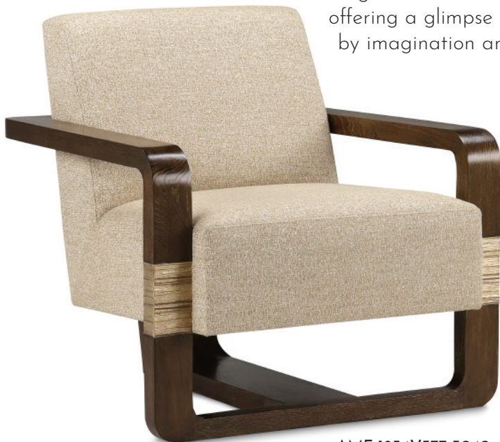
AMF-1854V377-3040 (Aquila Armchair - 3040)