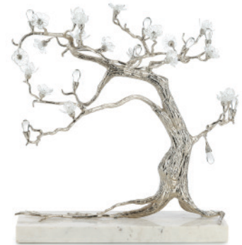
JRA-15983 (Sakura Sculpture on Marble, Nickel)