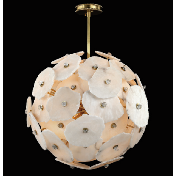
AJC-9513 (Montserrat Nine-Light Pendant)

The Fall 2025 introductions reflect the brand's continued pursuit of beauty that endures. Each piece demonstrates a commitment to thoughtful design and masterful craftsmanship, offering a glimpse into a world shaped by imagination and timeless appeal.