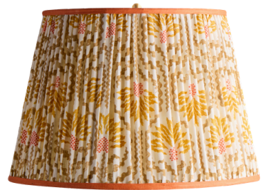
18" straight empire shade in Citrine Palmette linen, $230

Posy: Small, yet mighty. Aptly named after a fresh bunch of blooms, Posy is a hand-painted squiggly stripe that simply doesn't sit still. Because it's a multidirectional print, it's a total chameleon - happy to be paired with bold patterns or left to shine on its own. Available in four shades: 'Wavelet', 'Rust', 'Yolk', and the ever-regal 'Emerald'.