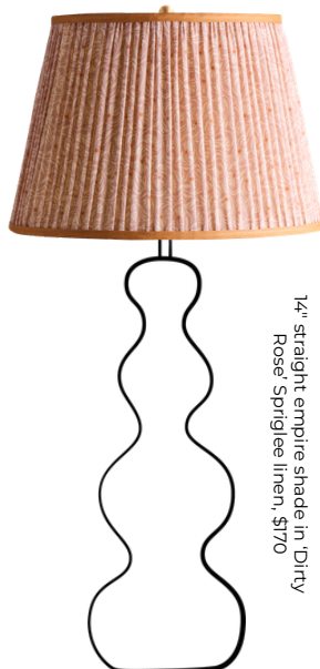
14" straight empire shade in 'Dirty Rose Spriggle' linen, $170