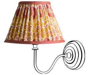
8" cordless empire shade in 'Papavero' Poppies linen, $80