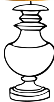
14" straight empire shade in 'Azura' Spriglee linen, $170