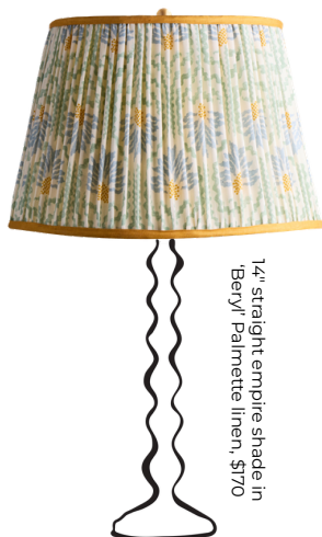
14" straight empire shade in 'Beryl' Palmette linen, $170