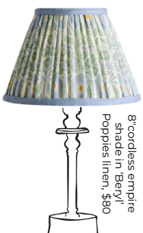
8" cordless empire shade in 'Beryl' Poppies linen, $80