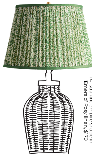
14" straight empire shade in 'Emerald' Posy linen, $170