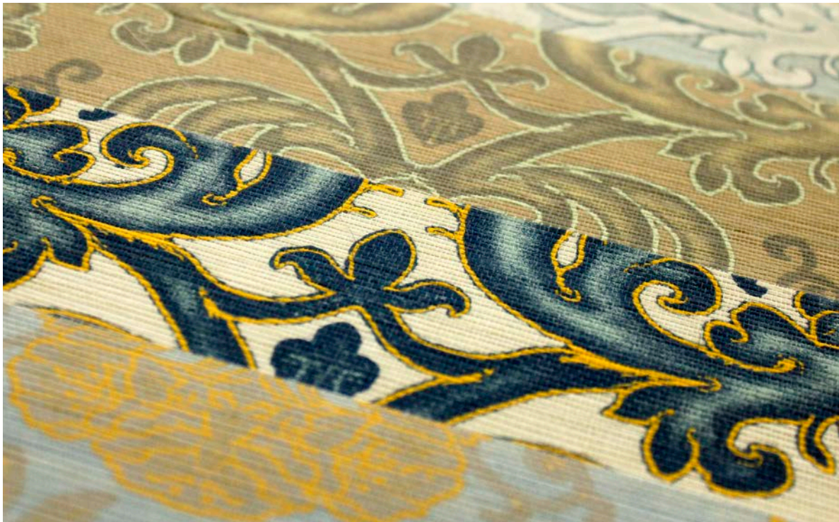
Chiara on grass cloth

Natura is a collection of murals that combines the high quality digital printing process with organic wall covering substrates. Natura includes a variety of grass cloths, paper weaves, and raffia. By expanding beyond the standard papers into these alternate substrates, Mural Sources is multiplying the possibilities for fine art murals and repeat patterns.