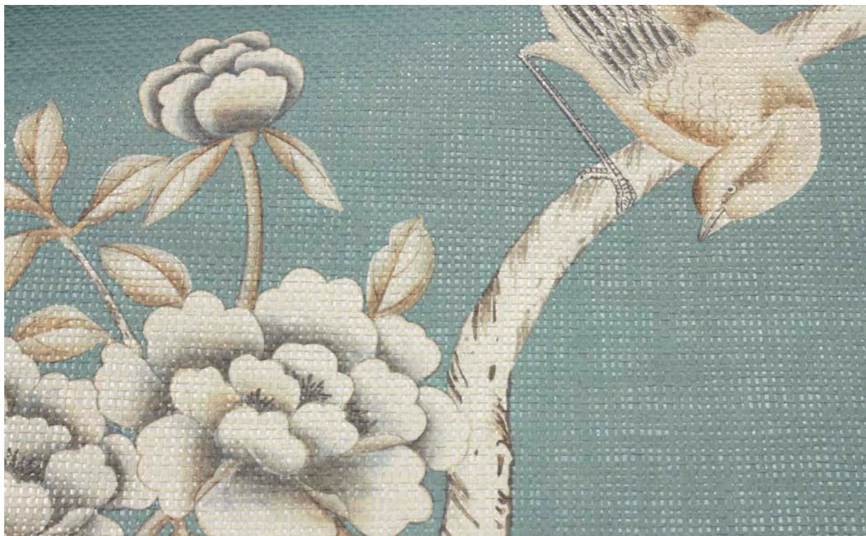
detail of Maysong Aqua on paper weave