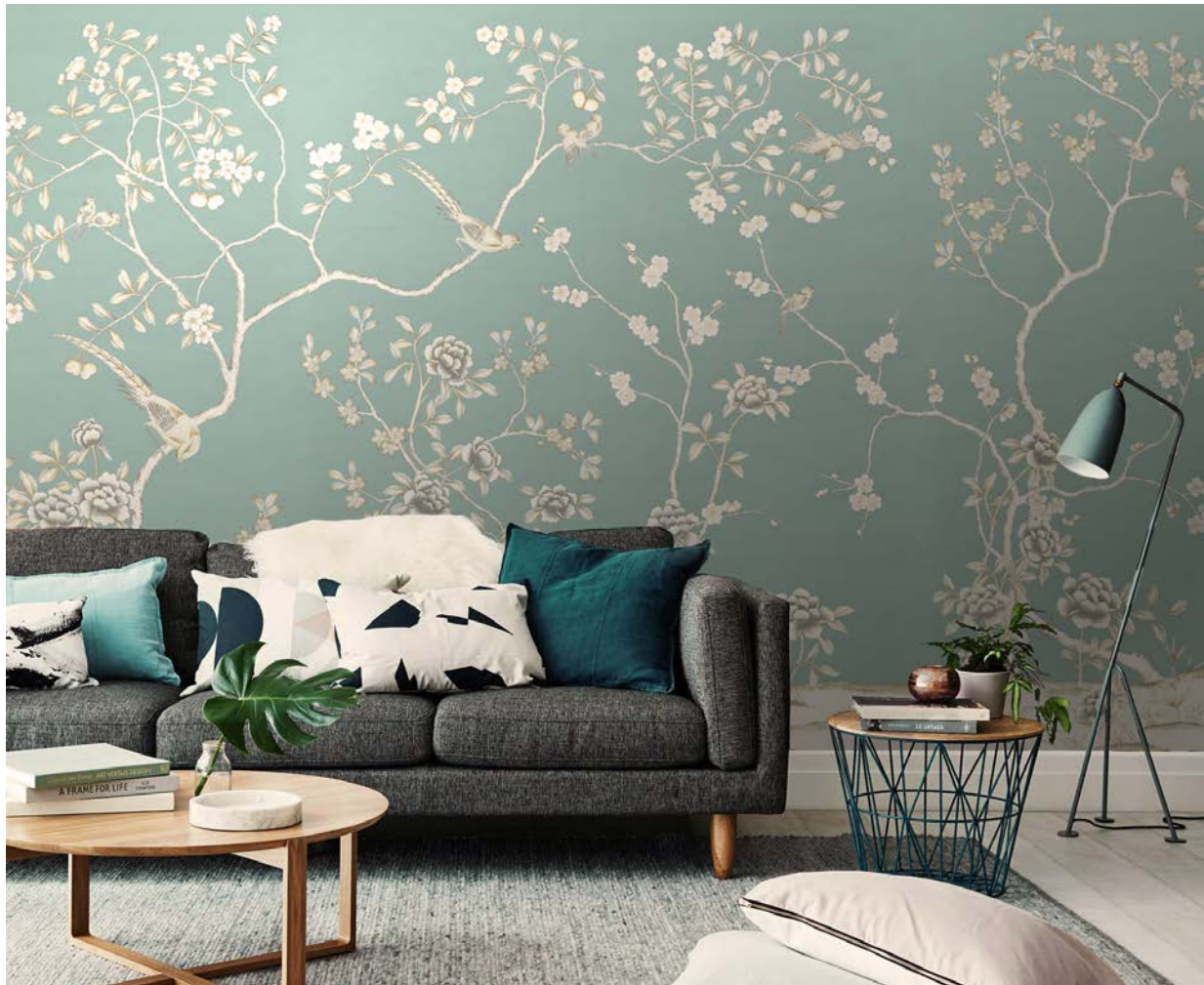
Maysong Aqua on paper weave