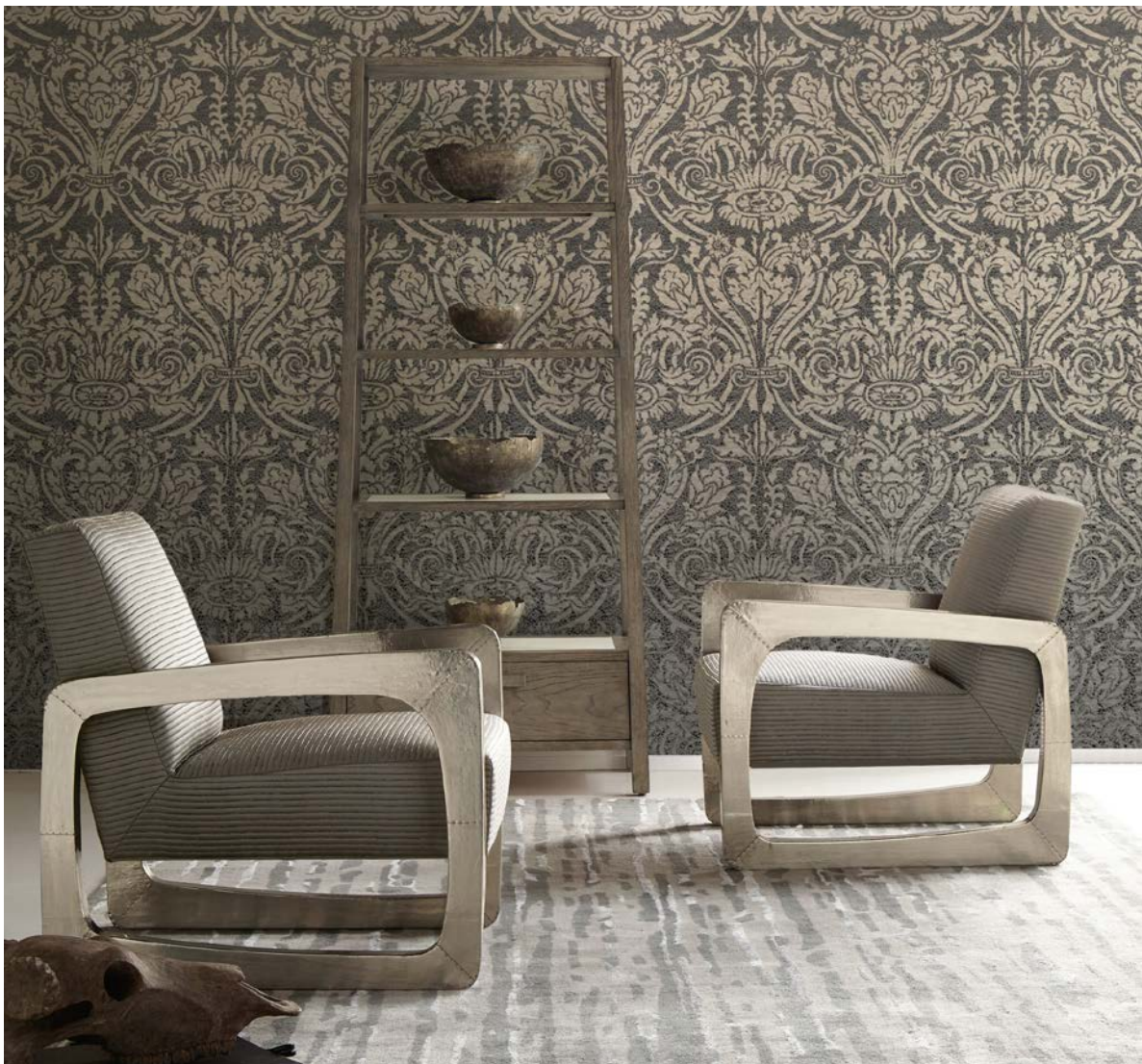
Grand Damask Ombré on paper weave

For the opportunity to see these new murals first hand, visit booth #M7054 in the Mezzanine at The Suites at Market Square from October 13th to 17th. To learn more visit www.muralsources.com or call us at 1-540-337-6494