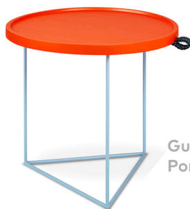
Gus* x LUUM Porter End Table