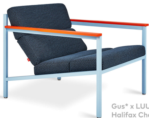
Gus* x LUUM Halifax Chair