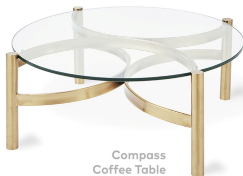
Compass Coffee Table