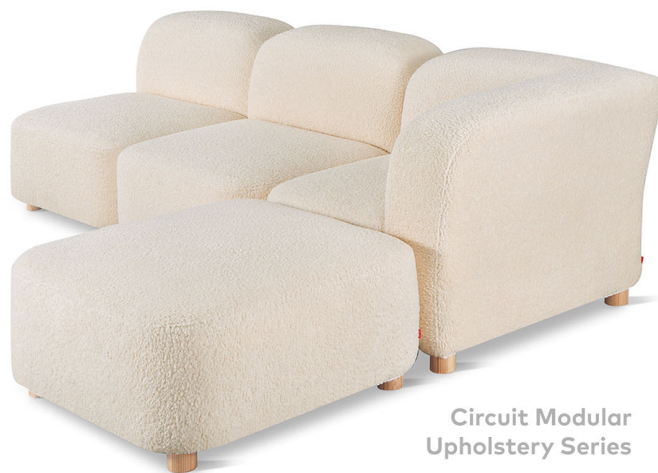
Circuit Modular Upholstery Series