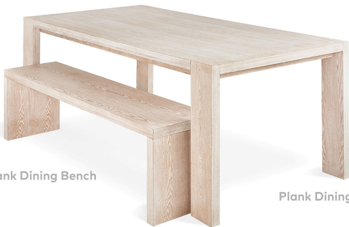
Plank Dining Bench