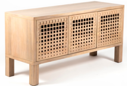
Above top, Manor & Mews dresses up a bedroom with the Fabian iron bed frame and veneered bedside table with gunmetal handles and a marble top. Above bottom, Manor & Mews' Gradient sideboard is an oak design with distinctive relief work on the doors.