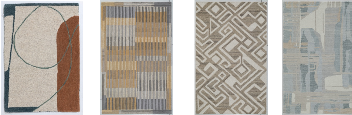
Above from left to right, The “Tout Le Monde” hand-tufted wool offering features vibrant colors, fluid lines and visual movement; “Jouer Faire” displays an array of colors and textures in both loop and cut pile wool; “Ethno Urban” blends heritage with modern-day elegance and includes PET Easycare fibers; and “Monterey” evokes the seaside.