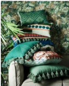
HAND MADE PILLOWS ON 100% LINEN AND 100% COTTON FABRICS