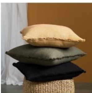
HAND MADE PILLOWS ON 100% LINEN AND 100% COTTON FABRICS