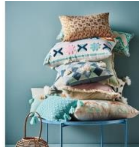
HAND MADE PILLOWS ON 100% LINEN AND 100% COTTON FABRICS