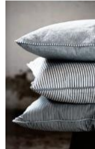
HAND MADE PILLOWS ON 100% LINEN AND 100% COTTON FABRICS