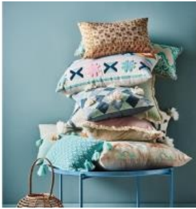
HAND MADE PILLOWS ON 100% LINEN AND 100% COTTON FABRICS

gaurav katyal Condor gaurav@condor.co.in +919810107007