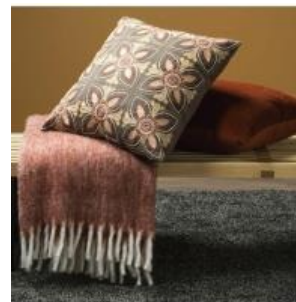
HAND MADE PILLOWS ON 100% LINEN AND 100% COTTON FABRICS