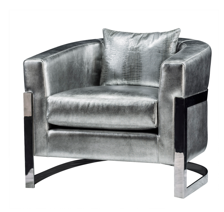
K.3000 Chair from the Trump Home by Dorya collection.

The Dorya team worked with European suppliers to develop the signature collection over the last 12 months. Dorya is dedicated to assisting designers on residential and commercial projects by providing an online service that can quickly generate real-time quotations and fulfill sample requests. This exclusive collection is in addition to the thousands of fabrics currently offered for Dorya. The new collection will offer cut yardage.