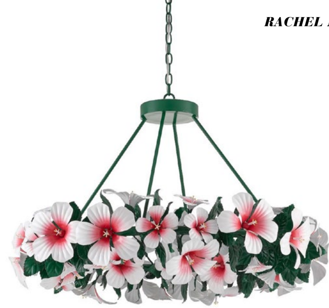
Currey & Company