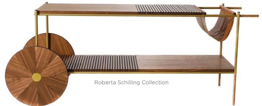
Roberta Schilling Collection