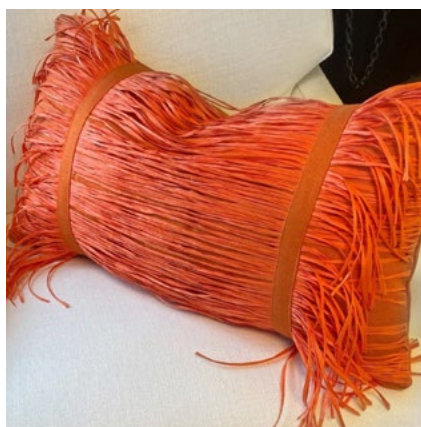
V Rugs & Home