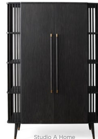
Studio A Home