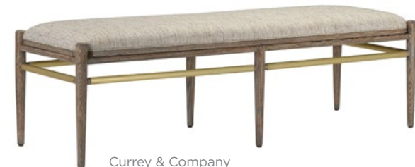
Currey & Company