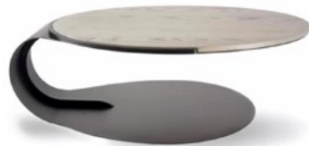
Bruce Andrews Design