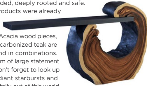
The Phillips Collection

Modern, statement live-edge furnishings, Acacia wood pieces, black forest marble, travertine, shell, and carbonized teak are furniture finishes we are seeing alone and in combinations. Florals are blooming this season in the form of large statement hardware and vibrant hibiscus lighting. Don't forget to look up to the stars — astronomical lighting, radiant starbursts and inky indigo celestial inspired textiles are totally out of this world.