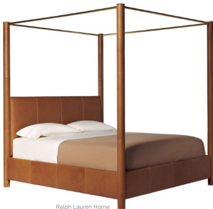
Ralph Lauren Home