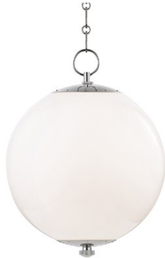
Hudson Valley Lighting