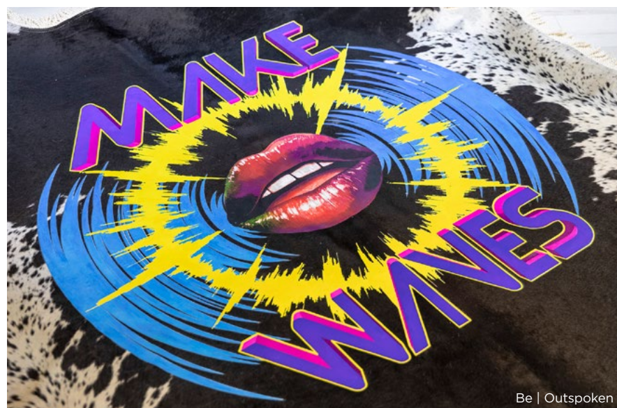
Be | Outspoken