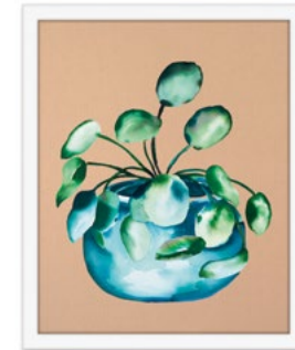
Prestige Arts/Art Trends