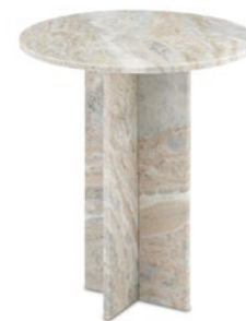
Currey & Company