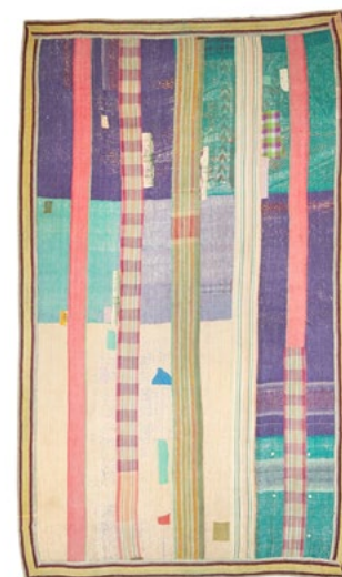
Aloka Home showing in Cisco Home